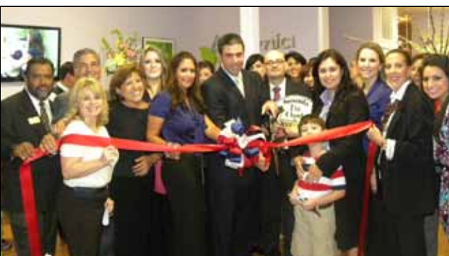
On Wednesday, December 14, 2011 Alquimia Spa located at 3380 Ruben Torres Blvd., Suite 204 hosted a ribbon cutting in celebration of their grand opening. The spa offers the latest cosmetic laser procedures for rejuvenation and hair removal as well as Botox and dermal fillers injections, skin rejuvenation, stretch mark removal, skin resurfacing, and many more.