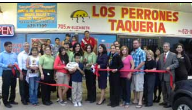
On Tuesday, December 13, 2011 Los Perrones Taqueria LLC. located at 705 W. Elizabeth St. hosted a ribbon cutting in celebration of their grand opening. They serve a variety of specialized tacos from tripas, molleja, al pastor, bistek, and fajita to their famous Taco Perron & the delicious Tacos de Birria. They are a family owned and operated business and look forward to serving you.