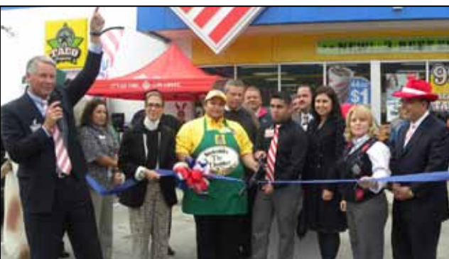
On Thursday, December 8, 2011 Stripes located at 2501 Central Blvd. hosted a ribbon cutting ceremony for their grand opening. Stripes Convenience Store teams deliver convenience with passion. It's an attitude that's reflected in every employee, in every store and it's the reason the company's slogans are-It's Go Time and Con Ganas-are more than just a catchy collection of words. They're an honest reflection of the unwavering spirit that makes Stripes.